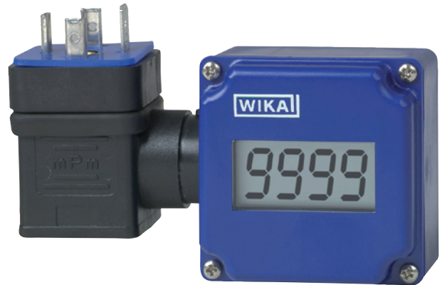
Attachable indicator model A-AI-1